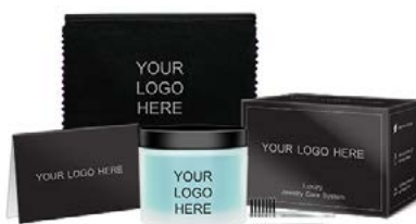
Luxury Revitalizing Jewelry Care System