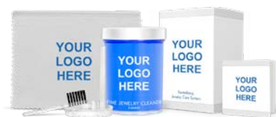
Classic Revitalizing Jewelry Care System