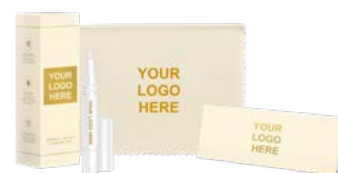
Sparkle + Shine® Cleaning Duo